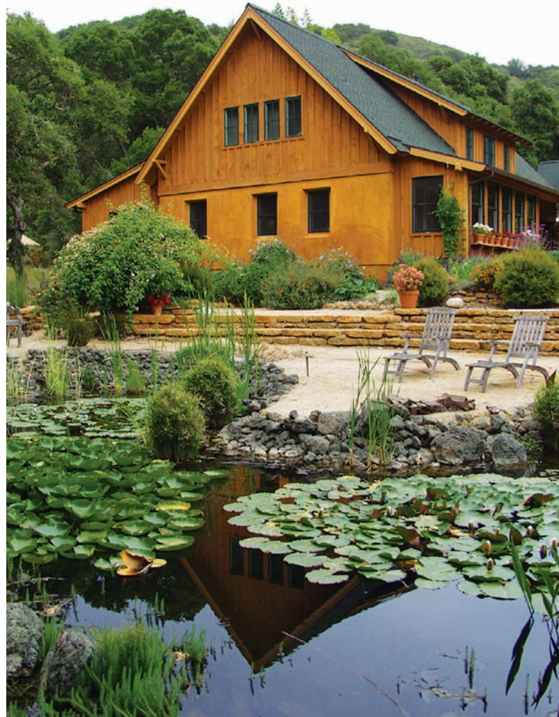
This home is constructed of straw bale, at some point in the future, similar Green homes may generate disputes over Green claims of performance and efficiency as builders advertise more of this popular product.

If you were ailing, you would go to a hospital or visit a doctor to cure your illness. You see a doctor because he or she knows how you are built and which remedy will cure your medical problem. If you had a major injury, you would not go before a judge or seek the assistance of an attorney—you would go to your doctor. And, if your injury were of a particular type, your doctor would refer you to a specialist. Likewise, if your construction project has a problem or dispute that requires attention, you